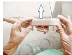
Figure 1 Enhanced Canopy Seal

Note: If the original canopy seals are present, and if necessary to achieve visible cleanliness, you may contact your Biomedical Department or GE Healthcare service personnel for canopy seal disassembly and reassembly