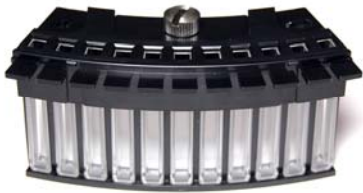
c4000 cuvette segment

The following pictures show examples of normal, undamaged cuvette segments: