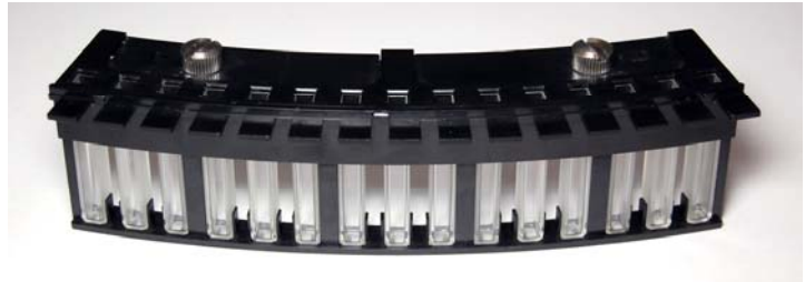
c8000 cuvette segment