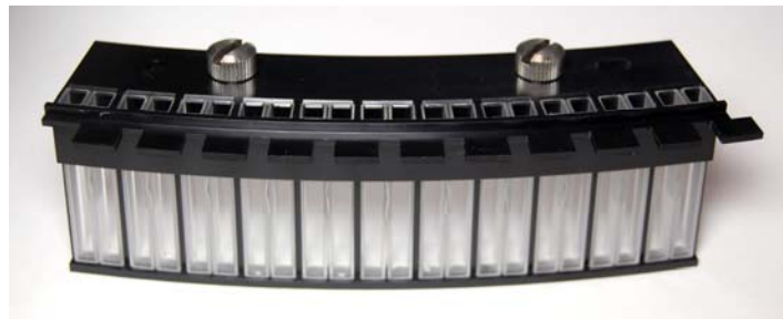
c16000 cuvette segment

The following pictures show examples of cuvette segments where the base is detached from the vertical support post.