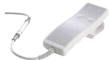
Hand Control and its cable

A new Hand Control including its cable will be sent to you when it is ready. The replacement instruction will be included in the shipment. After you receive the shipment, immediately replace the original one.