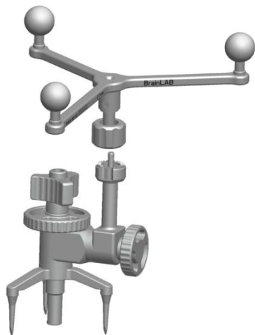
Figure 1: Skull Reference Base 52129A