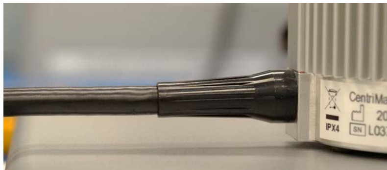
Figure 4: Cable Bend Relief at the Motor