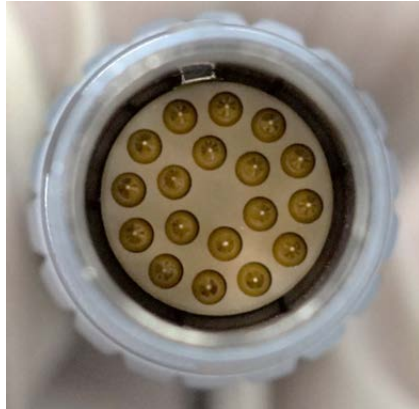
Figure 2: Motor Connector Pin View

Note: If there are any issues while connecting the CentriMag Motor to the CentriMag Console, inspect the Motor port on the rear of the Console for damage, particularly for any broken pins that may be lodged inside.